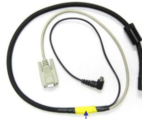
yellow heat shrink

This cable is included as a standard accessory with the PhytoFind and can be identified by the yellow band of heat shrink. The continuous data cable is used to connect the PhytoFind to a PC or data logger, supplying power to the instrument and streaming data.