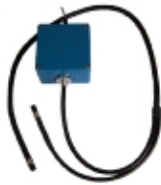
FIRE Fiber Optic Probe Accessory

This provides users the ability to do automated light response curves of chlorophyll fluorescence and quenching parameters using a uniform, fully characterized source.