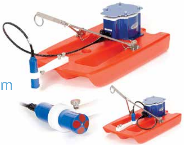
The StreamPro's transducer can be towed from the front or middle of the float, or can be removed and hand-held in the water for applications such as under-ice flow measurements.

Go right to work: StreamPro has been designed to allow any level of user to immediately begin collecting high-quality data. The simple and highly intuitive user interface has been designed to ensure proper operation.