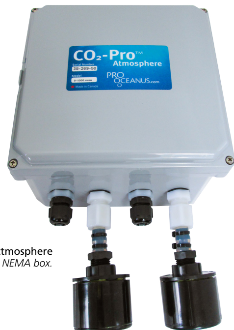
CO 2 -Pro Atmosphere NEMA box.