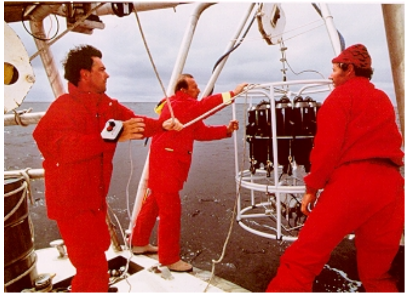
SBE 9plus mounted to Carousel

Sea-Bird's 911plus CTD is the primary oceanographic research tool chosen by the world's leading institutions.