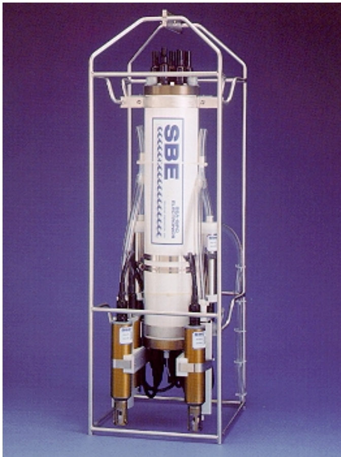
SBE 9plus shown with optional dual T & C sensors