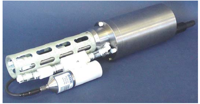
Shown with optional SBE 43F Dissolved Oxygen Sensor

The SBE 52-MP is a conductivity, temperature, depth (pressure) sensor (CTD), designed for moored profiling applications in which the instrument makes vertical profile measurements from a device that travels vertically beneath a buoy, or from a buoyant sub-surface sensor package that is winched up and down from a bottom-mounted platform. The 52-MP incorporates pump-controlled, TC-ducted flow to minimize salinity spiking. On typically slow-moving packages (e.g., 20 - 50 cm/sec), its sampling rate of once per second provides good spatial resolution of oceanographic structures and gradients. The 52-MP can optionally be configured with a Dissolved Oxygen sensor module (SBE 43F), as shown in the photo. The SBE 43F is a frequency-output version of our SBE 43 Dissolved Oxygen Sensor, and carries the same performance specifications.