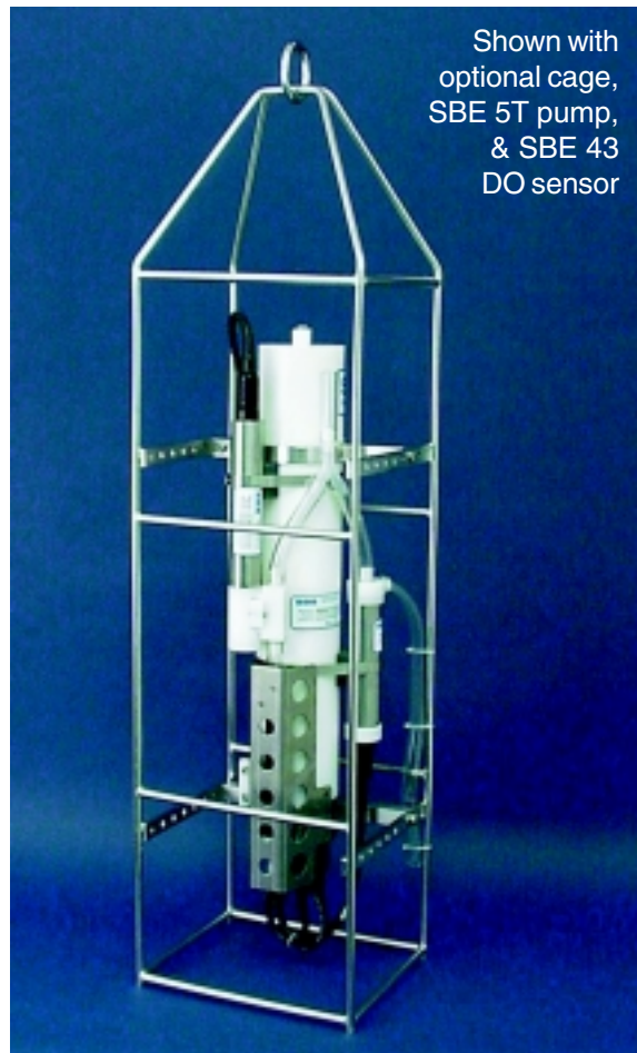
Shown with optional cage, SBE 5T pump, & SBE 43 DO sensor