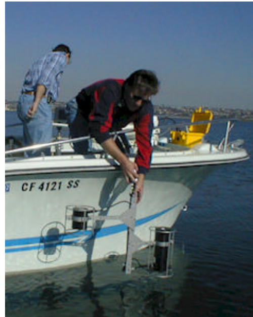
Deployment of PRR-2600 in optional "Split" configuration