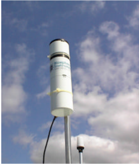
PRR-2610 Reference Radiometer