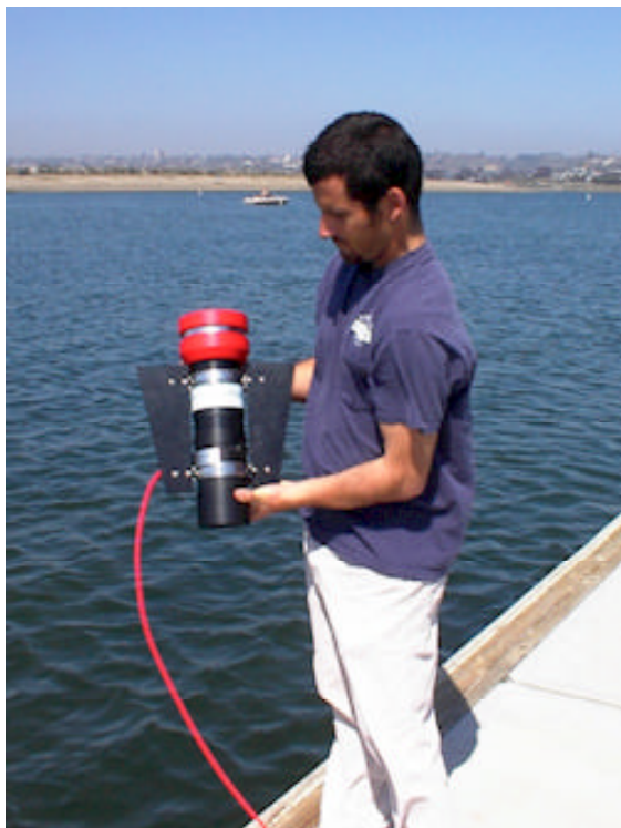
PRR-2600 In "Free-Fall" configuration